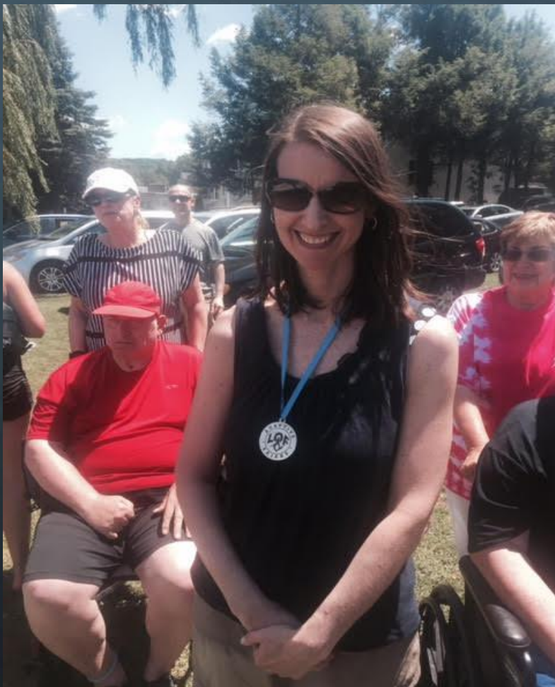
Helen Hayes Adaptative Sailing Clinic