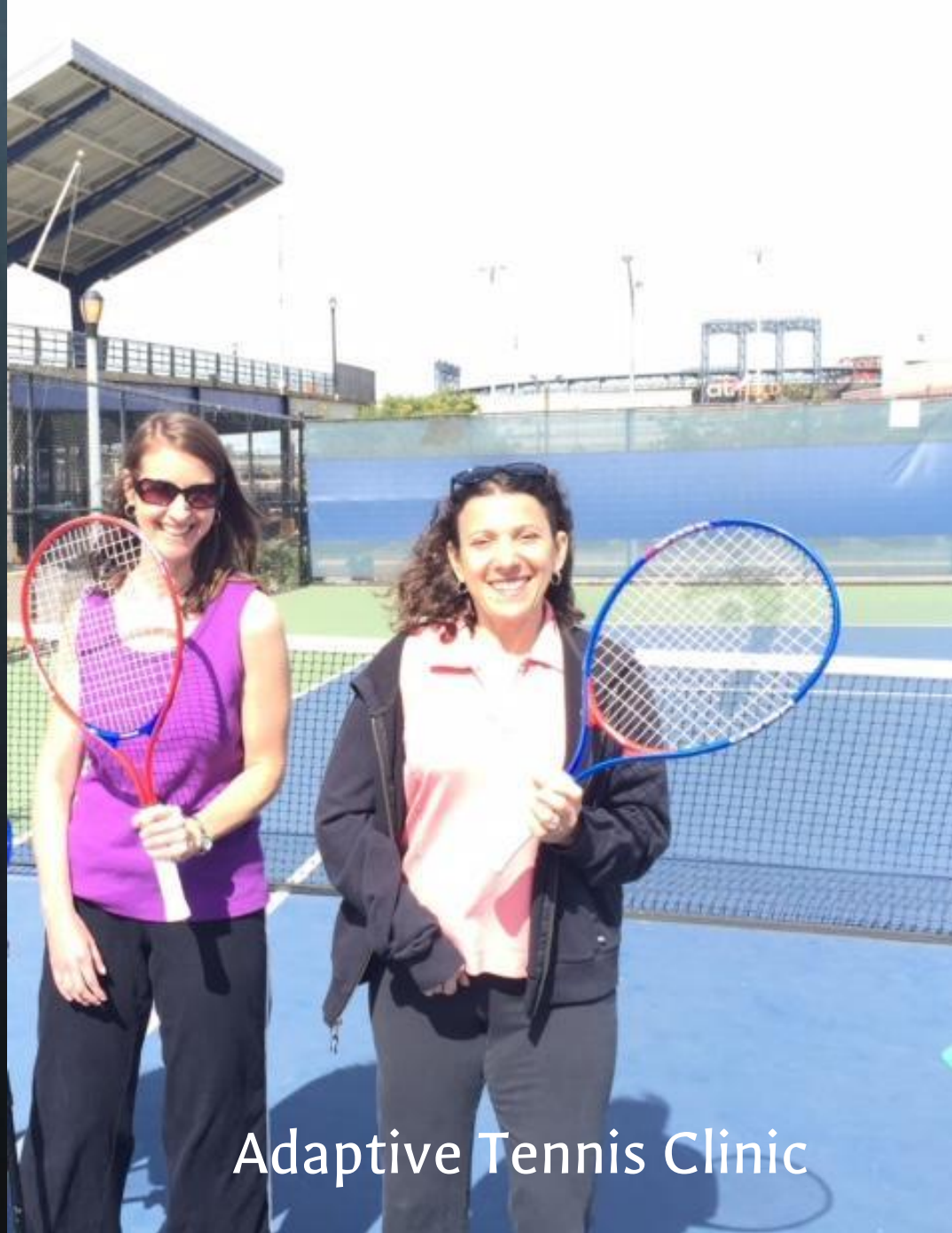
Adaptive Tennis Clinic