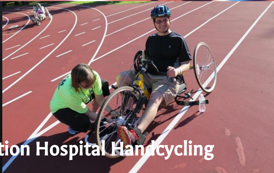
Burke Rehabilitation Hospital Handcycling